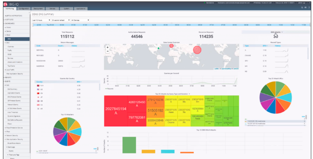
Figure 1: DNS DDoS attack details can be observed by all BIG-IQ managed BIG-IP products

THE NEED FOR REAL-TIME VISIBILITY INTO DNS DDoS IS CRITICAL. F5 BIG-IQ® CENTRALIZED MANAGEMENT CAN BE USED TO MEASURE DEVICE HEALTH AND INVESTIGATE DDoS ATTACKS.